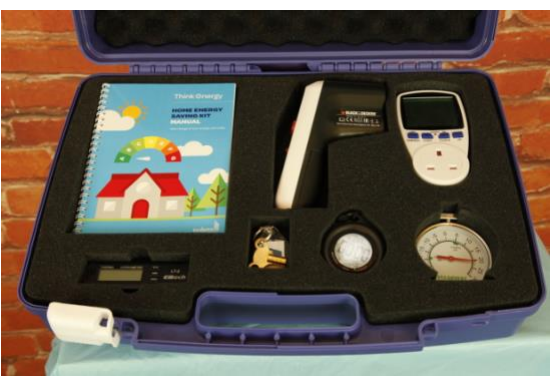
The CODEMA home energy saving kit

We undertook an in-depth evaluation of the performance of such kits in both Ireland (see SEAI, 2018) and New Zealand (Rotmann, 2018b). Use of the Task 24 "beyond kWh" toolkit was assessed using pre-and post-