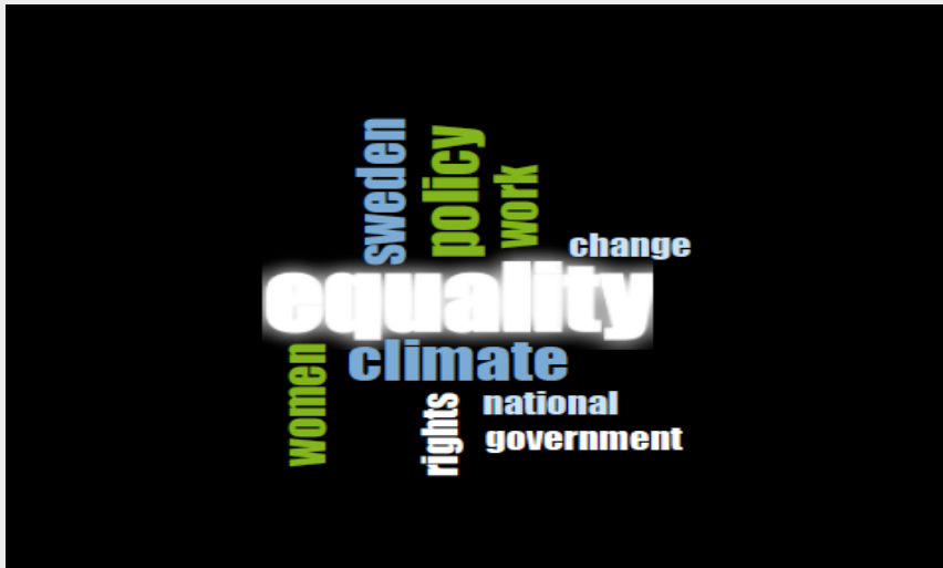
Fig 2: Word cloud analysis of the gender mainstreaming section (Sweden's NECP, pp 72).

Gender Mainstreaming is addressed in a separate section in the document (Sweden's NECP, pp 72) and reflects Sweden's long-standing adherence to principles of " jämställdhet ", the Swedish term for gender equality which became popular in the 1990s. Results from a word cloud analysis of the text under gender mainstreaming reveals that "equality" ( jämställdhet ) is the most frequently used word in this section (See Fig 2).